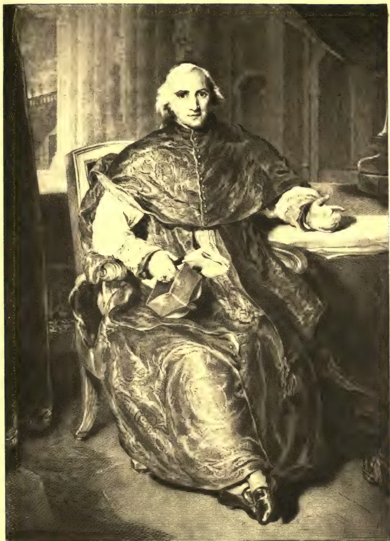
Cardinal Consalvi. Painted by Sir Thomas Lawrence.